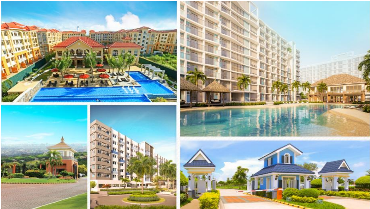
In Photo (Top Left) Sanremo Oasis, Gold - Mid Rise Development Visayas; (Top Right); Maldives Oasis Gold - Mid Rise Development Mindanao; (Bottom Left) Havila Township, Silver - Masterplan Development; (Bottom Middle) Futura Monte, Gold - Gold - Mid Rise South Luzon; (Bottom Right) Somerset Lane, Gold - Low Rise Development North Luzon

MANILA, PHILIPPINES — Filinvest Land one of the country's leading full-range property developers, secured multiple Gold awards for its residential projects across Luzon, Visayas, and Mindanao at the prestigious FIABCI Philippines Property and Real Estate Excellence Awards.