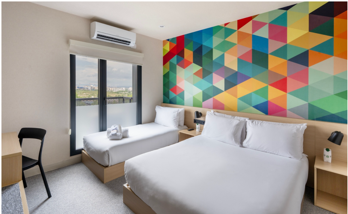
Hotel101's signature 21 sqm HappyRoom equipped with a practical kitchenette featuring microwave, refrigerator and kettle, luggage rack, 55" TV, free high-speed internet, work desk, modern bidet toilet, strong water pressure, and premium Emma Sleep mattresses