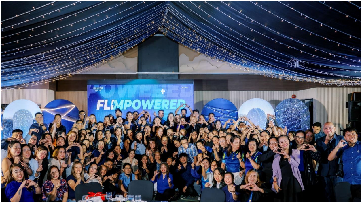
One team, one goal. The FLI Residential Business Unit sales force rallies to sustain momentum, ensuring growth across our RFO portfolio.

Mandaluyong City, Philippines — Filinvest Land, Inc. (PSE: FLI) demonstrated significant momentum in the first quarter of 2026, reporting a 4.5% increase in consolidated revenues to Php 6.31 billion. Net income after tax grew to Php 1.10 billion, fueled by a high-velocity business model that translated market demand into robust financial performance.