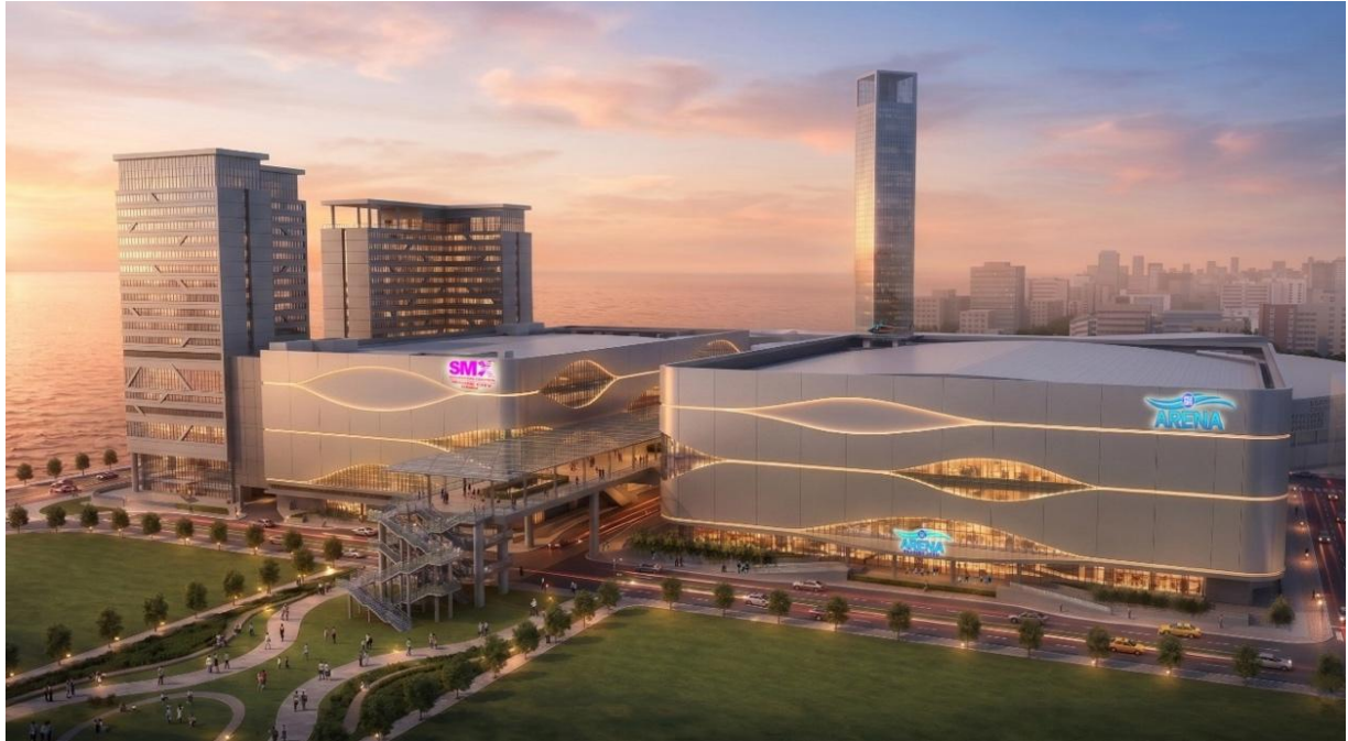
An architect's vision of the SM Seaside Cebu Arena.

(May 13, 2026, Pasay City, Philippines) SM Prime Holdings, Inc. (SM Prime) is set to open its second arena, the SM Seaside Cebu Arena, in June 2026. The large-scale venue is designed to meet global standards for live entertainment, sports and major events.