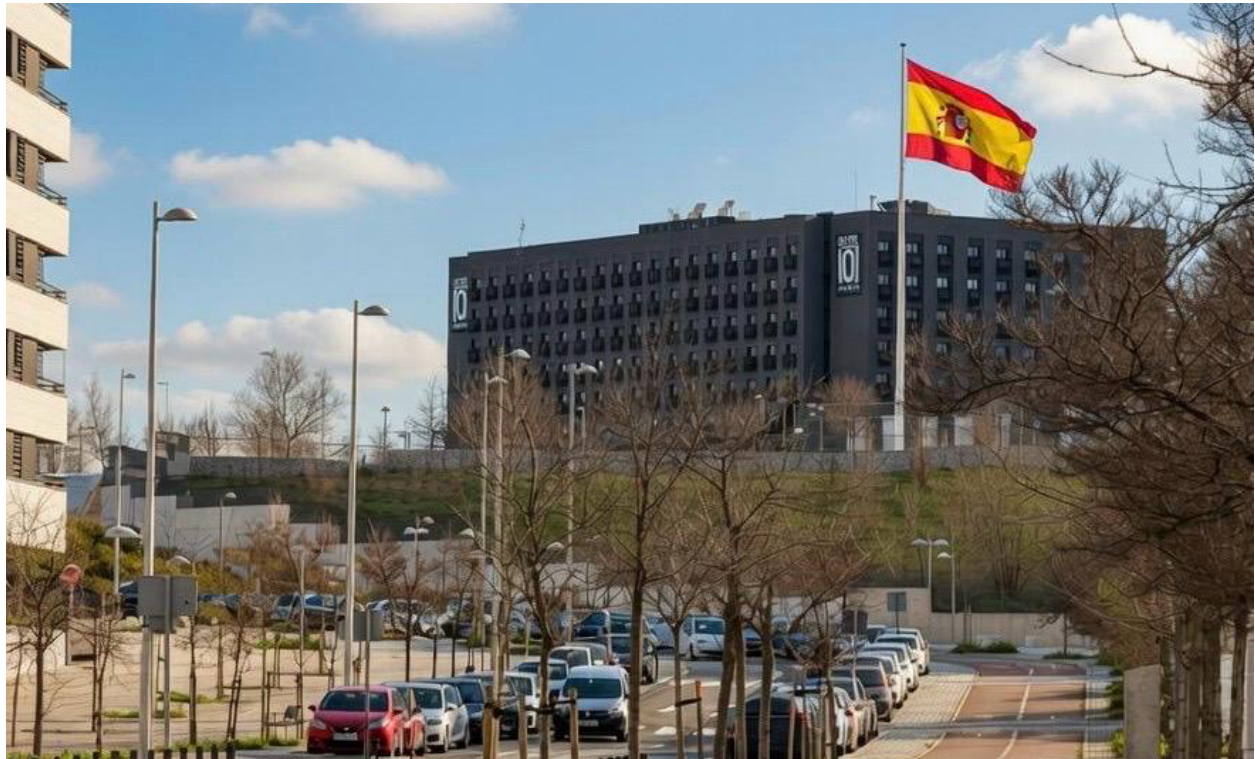
Actual photo of the 680-room Hotel101 in Madrid, Spain

DoubleDragon expects its Hotel101 subsidiary being an asset-light business model to become one of the major homegrown brands and business model export to other countries that would generate a significant US Dollar inflow to the Philippine economy.