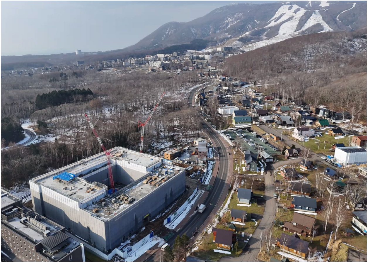
Aerial Photo of 482-room Hotel101-Niseko in the heart of Hirafu, Niseko, Hokkaido Japan