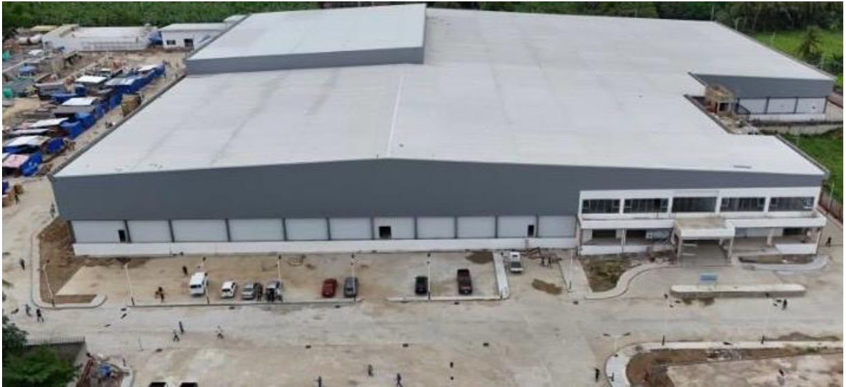
(Actual photo of DD's CentralHub warehouse complex in Cebu)

The foregoing disclosure contains forward looking statements that are based on certain assumptions of Management and are subject to risks and opportunities or unforeseen events. Actual results could differ materially from those contemplated in the relevant forward looking statement and DoubleDragon gives no assurance that such forward-looking statements will prove to be correct or that such intentions will not change. This Press Release discloses important factors that could cause actual results to differ materially from DoubleDragon's expectations. All subsequent written and oral forward-looking statements attributable to the Company or persons acting on behalf of the Company are expressly qualified in their entirety by the above cautionary statements.