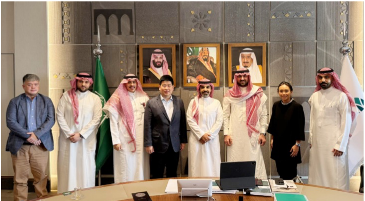
On the same day of the signing, the partners also met with the Mayor of Medina, Saudi Arabia H.E. Fahad Albuliheshi to discuss the Group's expansion plans in Medina, Saudi Arabia.